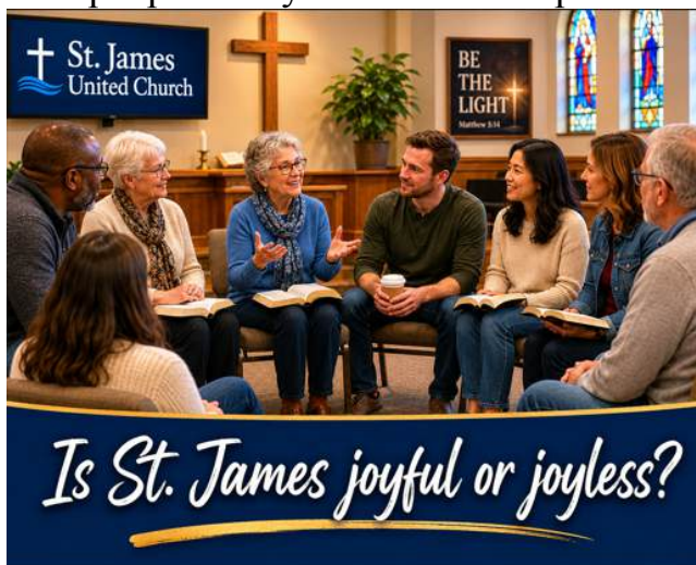
AI generated image